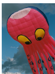
Peter Lynn Octopus